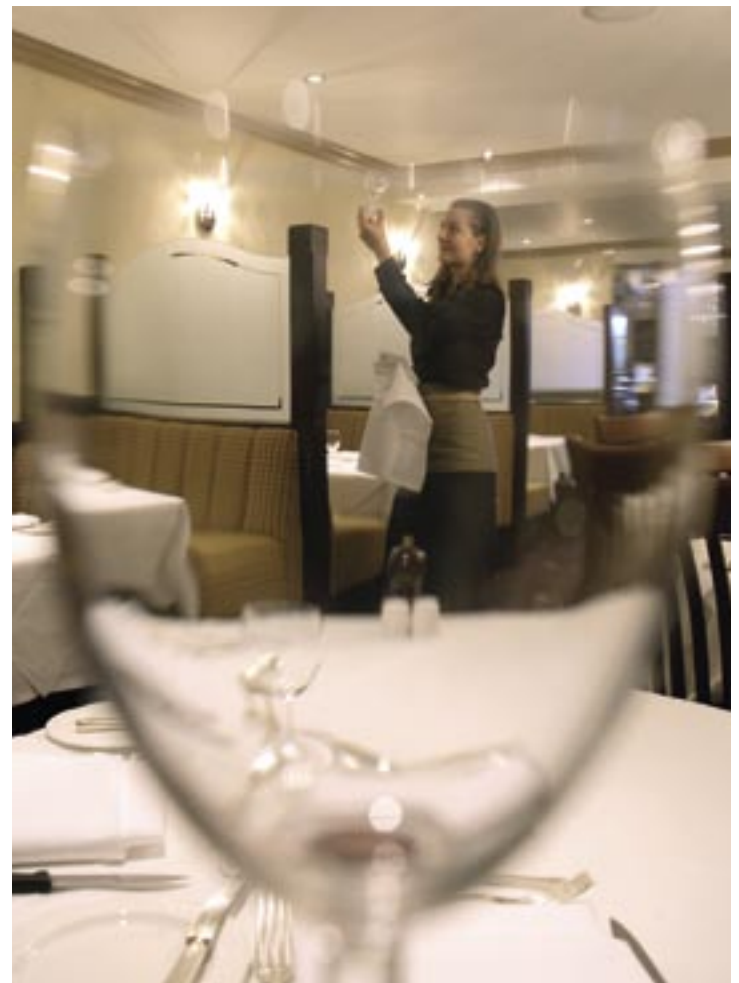
■ Clean energy: The Imperial Hotel is at the heart of the industry.

"Yarmouth is lucky to have the offshore industry based here and we should appreciate what it has done for the town and the vital importance to us as a small business in the supply chain."